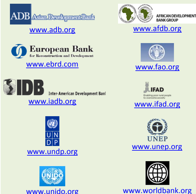
FIGURE 1. GEF Agencies

10. The LDCF Project Proponent secures the endorsement of the national GEF Operational Focal Point.