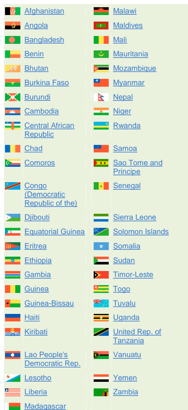
TABLE 1. List of LDCs as of June 2010